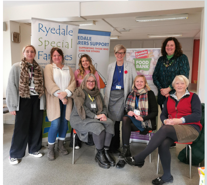
The group in Pickering included IDAS and Pickering CIC

No queuing on phones, no talking to a computer, just friendly faces and a cuppa. You can hear about all the activities going on locally, volunteering opportunities and speak to the person you need to resolve a problem.